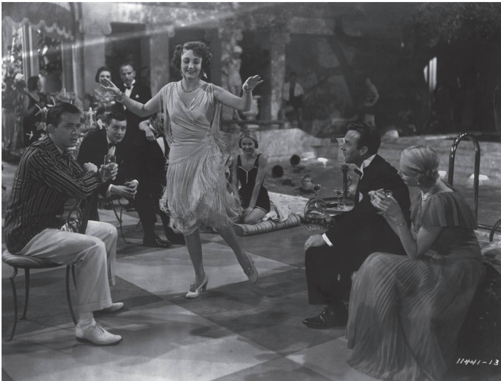
A still from the 1949 film production of The Great Gatsby .